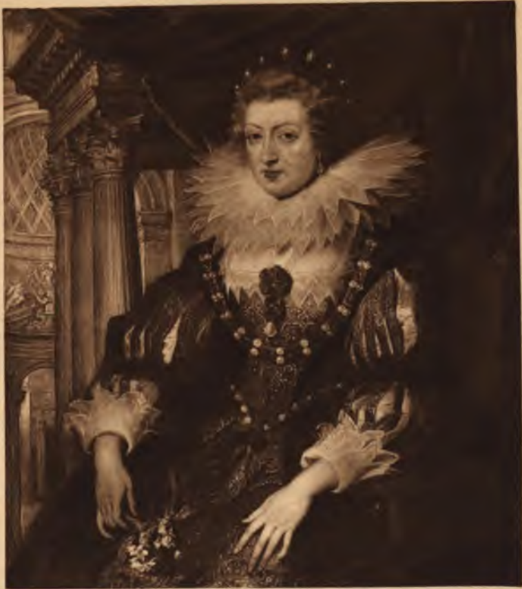
Elisabeth of France, Queen of Spain